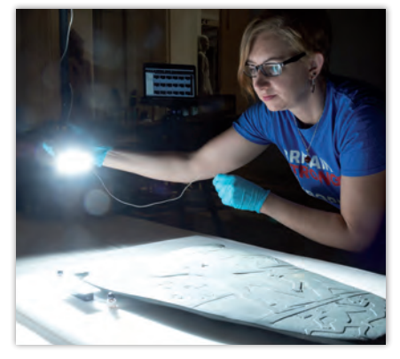
Reflectance Transformation Imagina involves the systematic application light from different positions and angles to the artefact surface.

Clues for episodes of carving and their sequence are evident when comparing the pairs of composite human-bovid heads surmounting each side of the Narmer Palette. Differences in carving technique and the style of the elements of the face and head suggest that more than one artisan was involved, if not also the passage of time between carving episodes. For example, RTI visualisations help clarify adjustment to the eyebrows of the bovid-human head on the Palette's front, upper left. Traces show that the eyebrows were set quite high on the face, but then partially erased/ polished away and recarved several millimetres lower down (3.). This rather significant compositional change raises