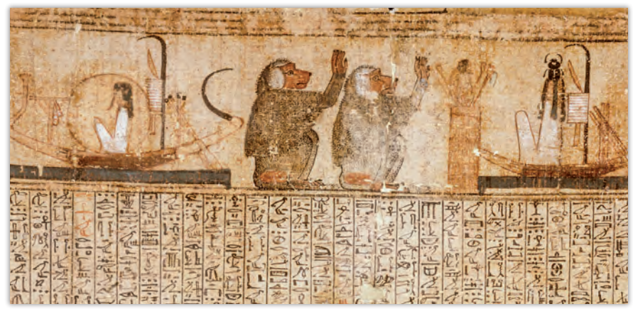
Adoration of Khepri and Re, papyrus of Kenna, Leiden.

The exhibition starts with introduction to the various contrasting creation myths of religious centres such as Heliopolis, Memphis, Hermopolis, and Aswan. This section features the famous Shabaka stone from London with its account of the creation of the universe by Ptah, and a recently acquired relief from Leiden showing the god Khnum at his potter's wheel.