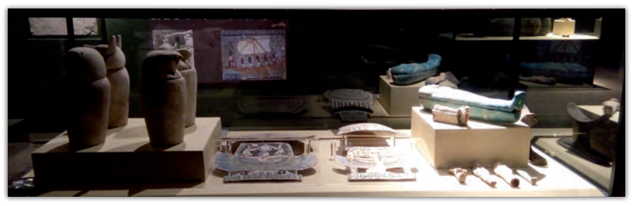
Canopic jars and ushabtis in the Sohaq National Museum.