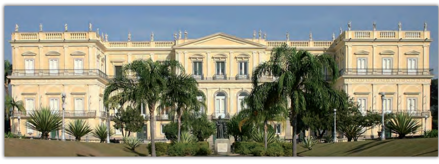
The National Museum in Rio before the fire.

The Egyptian collection in Rio was the largest in Latin America, with more than 700 artefacts. An Italian merchant named Fiengo brought the core of the collection to Rio, where it was purchased by the then emperor Pedro I in 1826. Pedro II, last emperor of Brazil, travelled to Egypt in 1871 and 1876, and brought more artefacts back to the country. Alongside royal and private shabtis, Third Intermediate Period coffins, and human and animal mummies, the collection included a large group of Middle Kingdom and New Kingdom stelae. The stelae of Raia and Haunefer are unique: they date from the 19th dynasty and provide evidence from Egypt of Semitic titles found in the Bible and in cuneiform tablets from Mari. The 19th dynasty painted limestone statue of a young women wearing an ointment cone on her head is equally unique. Representations of such cones are otherwise known almost exclusively from wall paintings and reliefs.