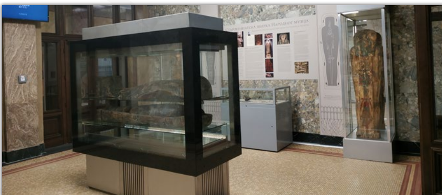
A special showcase was acquired for Nesmin's coffin and mummy in the National Museum, Belgrade.

The upper lid of the coffin of Neferrenepet in the National Museum, Belgrade.