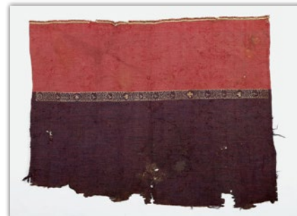
The exhibition 'De lin & de laine'. Examples of textiles displayed.