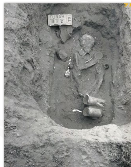
Tomb 19.g.2 – unpublished.

Each object will be drawn, photographed and analysed according to a catalogue of criteria, based on a series of research questions. We would like to answer questions concerning the structure and the development of the cemetery, its chronological development, as well as reasons for its lay-out. The choice of the grave goods for each tomb will give us insights into the social structure of the community, their economic background and their funeral customs. Situated only 7 kms to the north of the main cemetery of the old capital Memphis in Helwan, it is also interesting to study its relationship to that necropolis. Similarities and differences from other contemporary cemeteries will furthermore help us to understand the process of state formation. In this respect we are employing scientific analyses of diverse materials, such as pottery and stone