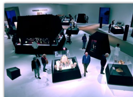
'Nubia. Land of the Black Pharaohs' in the Drents Museum in Assen, the Netherlands.