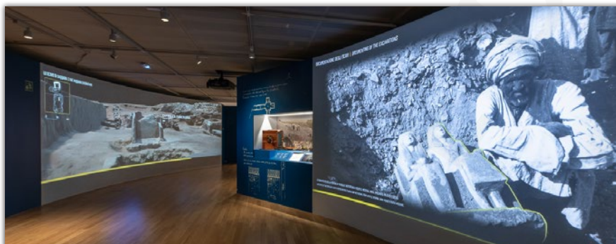
Two wall projections about photography and photogrammetry in archaeology.