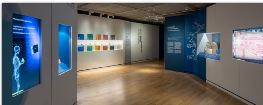
Overview of the section 'Testing'.

The storyline of the exhibition is then presented as a 'journey to the invisible and back', and is divided into three sections, each dedicated to a specific moment in the biography of an artefact. In the first one ('Archaeology'), two wall projections show how photographic techniques have evolved over time into photogrammetry, which can be used to document archaeological contexts. The second section ('Testing') opens with modern examples of binders, raw minerals and related pigments commonly