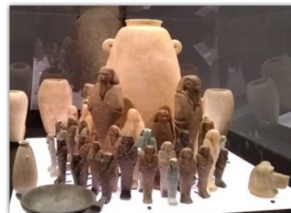
Shabtis of Taharqa and Senkamnisen are displayed at the Drents Museum along with canopic jars and other stone vessels.