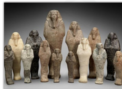
Shabtis from the tomb of Taharqa in Nuri, Pyramid 1 (Tomb of Taharqa), A 16. 1917: excavated by the Harvard University–Boston Museum of Fine Arts Expedition; assigned to the MFA in the division of finds by the government of Sudan.

> Land of the Pharaohs, Drents Museum > Nubian Art, MFA